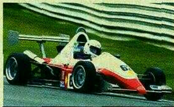
Corbyn won two Monoposto 1200 races